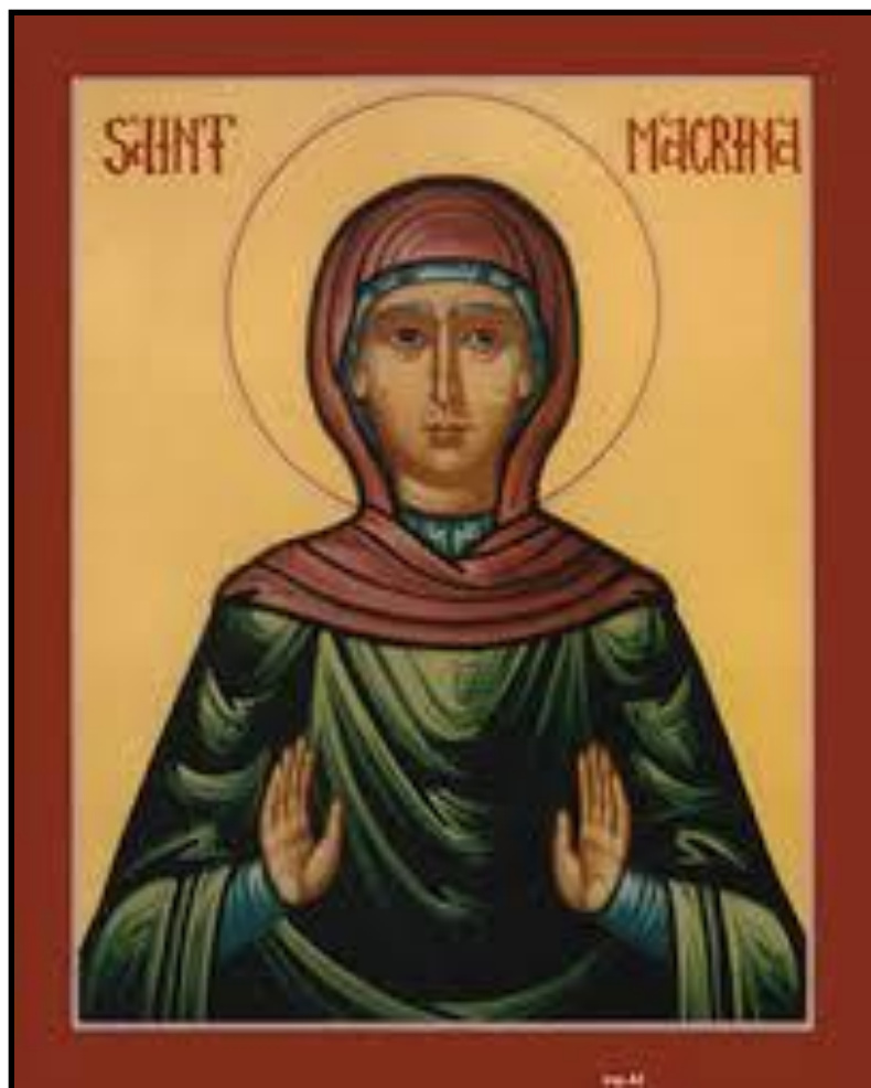
Saint Macrina the Elder